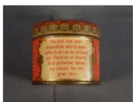
Chase & Sanborn coffee tin, back view