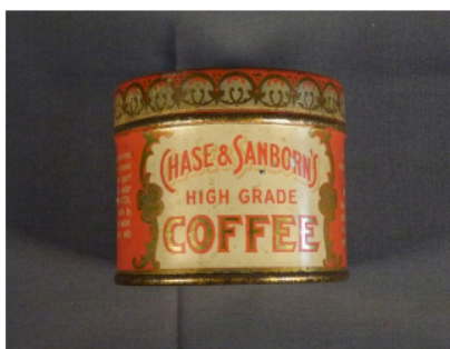
Chase & Sanborn coffee can, front view