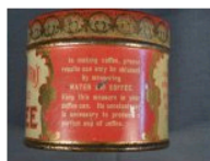
Chase & Sanborn coffee tin, left view